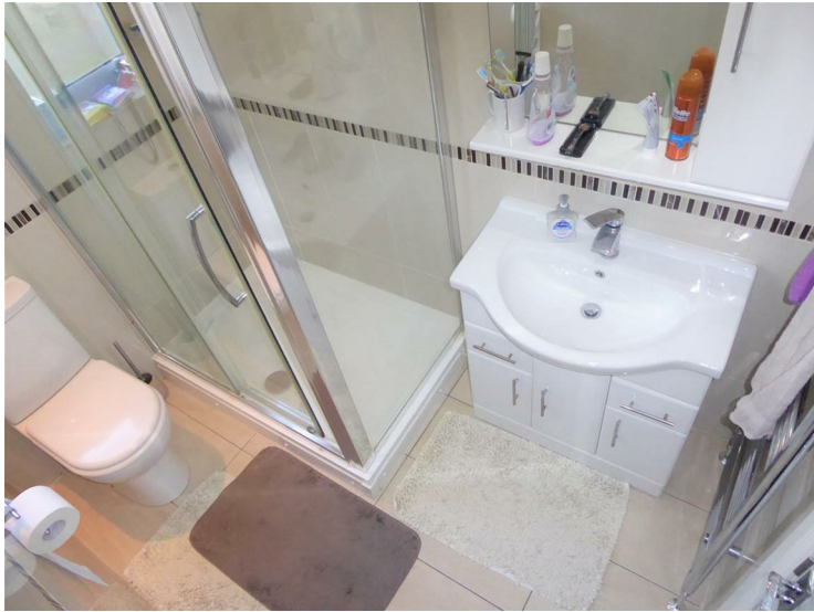
Tiled enclosed shower cubicle with wall mounted shower unit, wash hand basin with mixer tap and vanity unit below, low level w.c, tiled walls and flooring, double glazed window, heated towel rail.