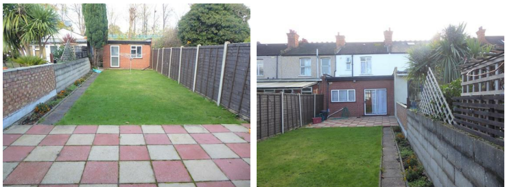
Paved patio area, rest laid to lawn area with borders.