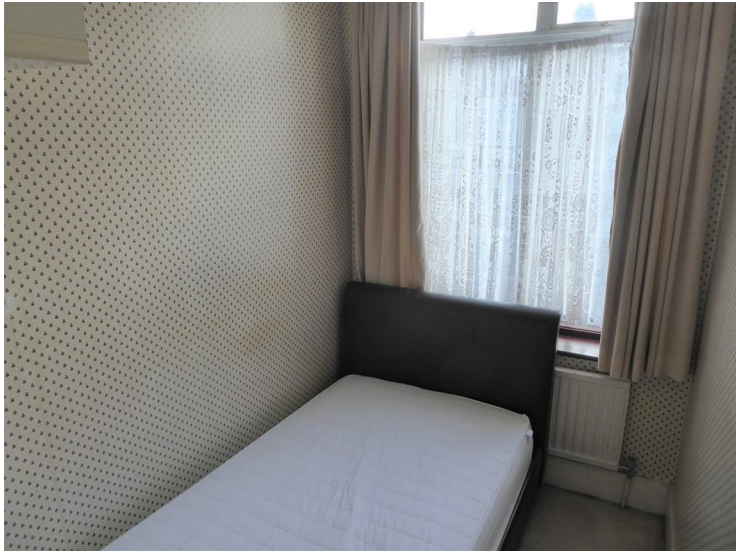
Front aspect double glazed window, radiator.